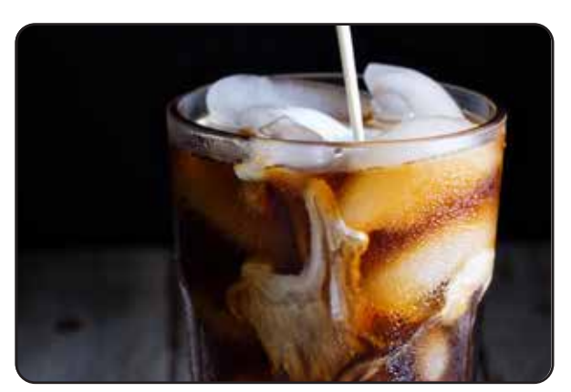
made with Häagen-Dazs