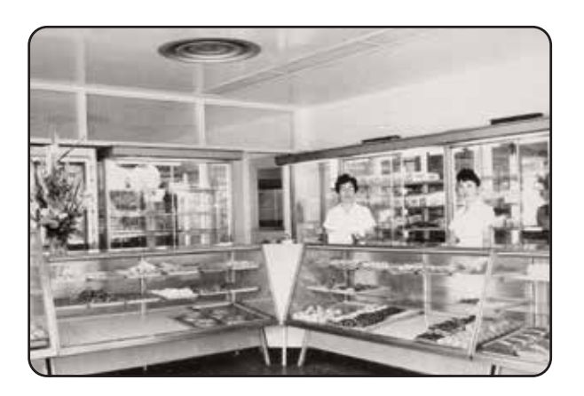
Some things never change.... And at Liliha Bakery, that's a good thing!