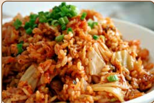
KIM CHEE FRIED RICE & EGGS 19.50 Served with your choice of ham, bacon, pork sausage, portugese sausage, spam or vienna sausage. Add 2 slices of cheese 0.89