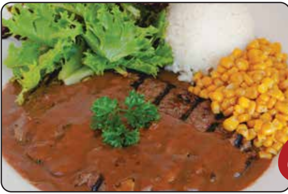
Clam Chowder 4.95

Served with our famous butter roll , rice, corn, and your choice of mixed greens or potato-mac salad