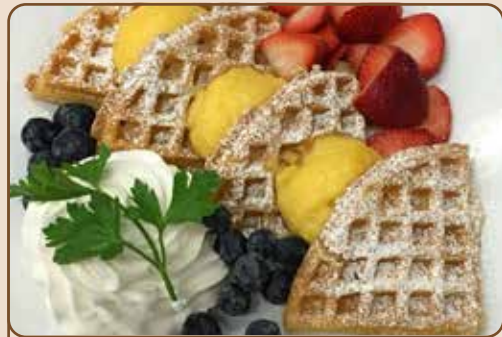
MAC NUT WAFFARD 17.95 Waffle, custard, and fresh fruits