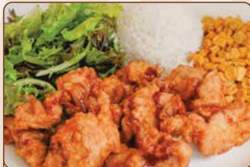
CHICKEN KARAAGE 18.50 Topped w/ remoulade & teriyaki sauce and served with our famous butter roll , rice, corn, and your choice of salad